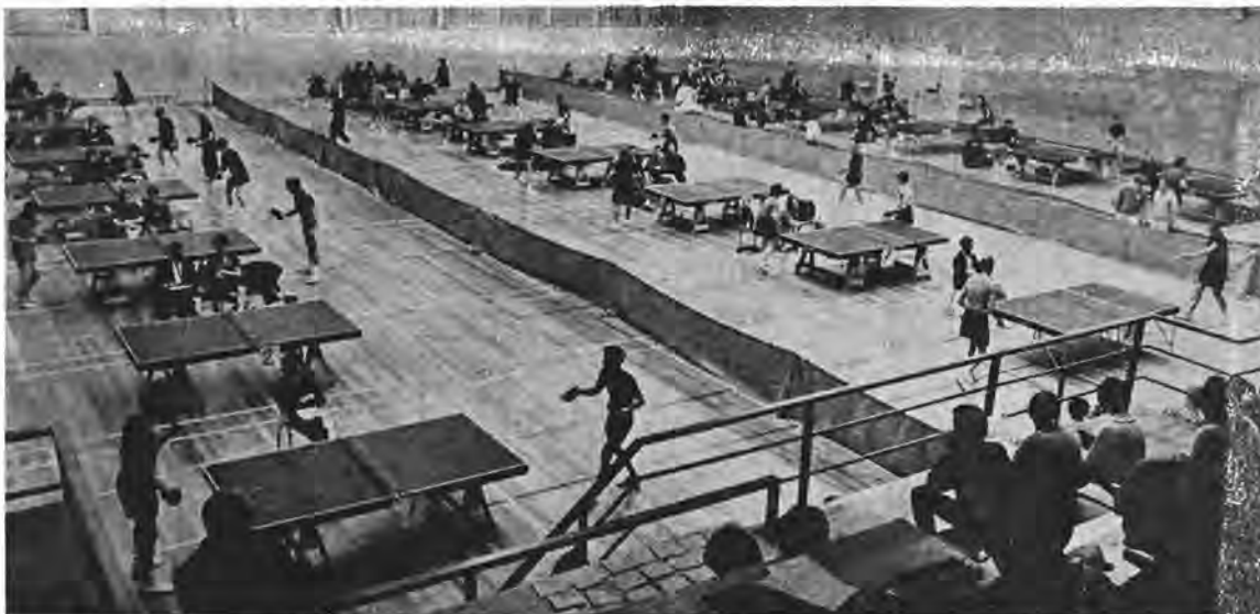
THIS BUSY SCENE WAS SHOT IN THE SPRINGVALE STADIUM, WANGANUI, DURING THE 1967 NEW ZEALAND CHAMPIONSHIPS

in 1949, his detailed publicity-angled resumé of the playing records, interests and styles of the visitors have played a vital part in the publicity build-up by our provincial associations who have had the good fortune to play hosts to our visitors.